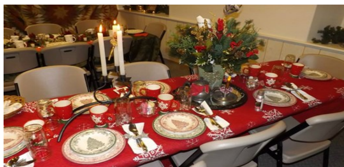
One of the beautiful tables that we en-