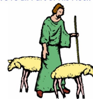
The Retired & Re-Fired Group Centenary United Methodist Church