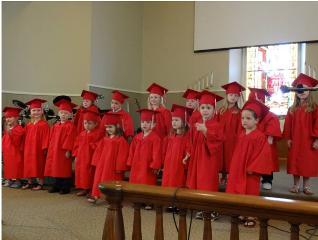
Gingerbread Nursery School Class of 2013