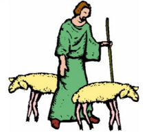
The Retired & Re-Fired Group Centenary United Methodist Church

We also came to realize that we are a lot like wayward sheep. We don't do well on our own either, and we need a good shepherd. Jesus wants to be our shepherd. He said, "I am the Good Shepherd, the Good Shepherd giveth his life for the sheep."